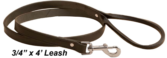
3/4" x 4' Leash

1551 BN 3/4" X 6' BLACK FLAT CREASED LEASH MADE OF HEAVY ENGLISH BRIDLE LEATHER WITH A ROLLED HAND HOLD AND A NICKEL SNAP