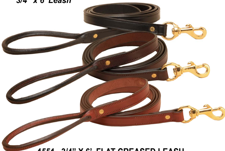
3/4" x 6' Leash

1551 3/4" X 6' FLAT CREASED LEASH MADE OF HEAVY ENGLISH BRIDLE LEATHER WITH A ROLLED HAND HOLD AND A BRASS SNAP 1551 B BLACK 1551 H HAVANA 1551 O OAKBARK