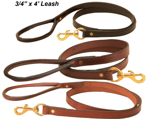
3/4" x 4' Leash

1553 3/4" X 4' FLAT CREASED LEASH MADE OF HEAVY ENGLISH BRIDLE LEATHER WITH A ROLLED HAND HOLD AND A BRASS SNAP 1553 B BLACK 1553 H HAVANA 1553 O OAKBARK