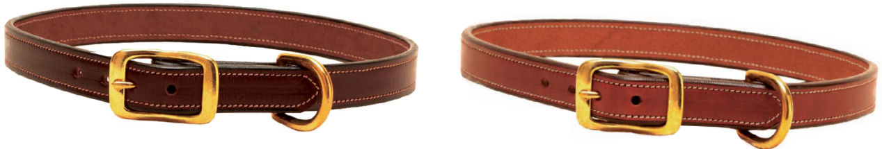
1503 3/4" ENGLISH BRIDLE LEATHER COLLAR WITH SADDLE STITCHED EDGES AND A BRASS BUCKLE AND DEE