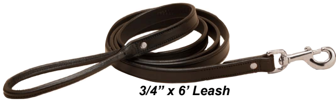
3/4" x 6' Leash

1551 BN 3/4" X 6' BLACK FLAT CREASED LEASH MADE OF HEAVY ENGLISH BRIDLE LEATHER WITH A ROLLED HAND HOLD AND A NICKEL SNAP