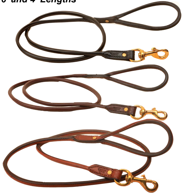
1569 4' ENGLISH BRIDLE LEATHER ROLLED LEASH WITH A BRASS SNAP

1570 B BLACK 1570 H HAVANA 1570 O OAKBARK