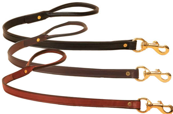
3/4" x 2' Leash

1556 3/4" X 2' FLAT CREASED LEASH MADE OF HEAVY ENGLISH BRIDLE LEATHER WITH A BRASS SNAP 1556 B BLACK 1556 H HAVANA 1556 O OAKBARK