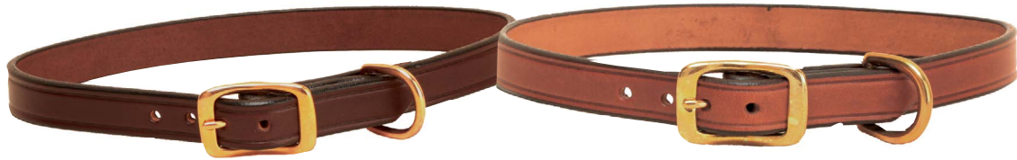
1500 3/4" ENGLISH BRIDLE LEATHER PLAIN CREASED COLLAR WITH A BRASS BUCKLE AND DEE