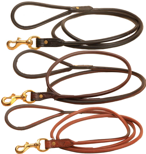
1570 6' ENGLISH BRIDLE LEATHER ROLLED LEASH WITH A BRASS SNAP

1570 B BLACK 1570 H HAVANA 1570 O OAKBARK