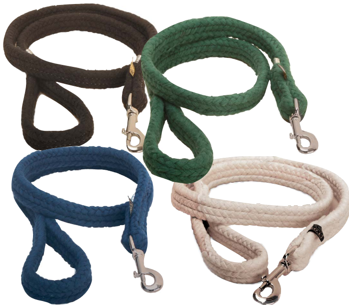
1578 1" x 4' SOFT, FLAT BRAIDED COTTON LEASH WITH A NICKEL SNAP

1578 B BLACK 1578 G DARK GREEN 1578 N NAVY 1578 WT WHITE