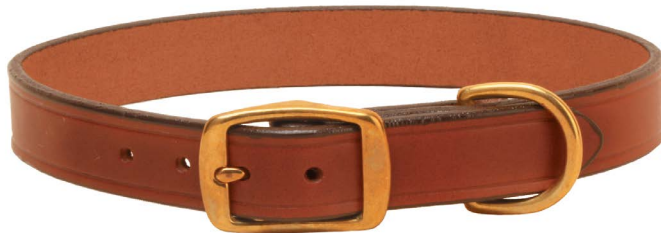
1536 OAKBARK ENGLISH BRIDLE LEATHER COLLAR WITH BRASS BUCKLE AND DEE