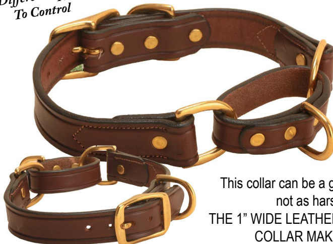
1540 H MARTINGALE COLLAR WITH BRASS BUCKLE AND DEES