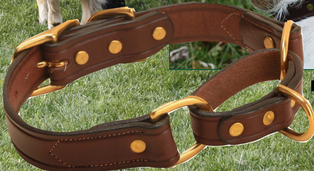
Martingale Collar on page 2